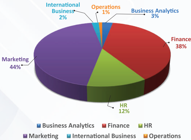
OVERVIEW BATCH PROFILE 2022-24